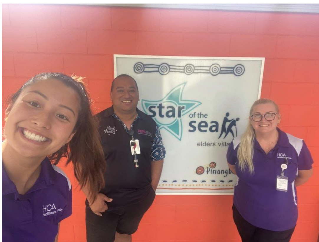
Star of the Sea Elders Village, Thursday Island