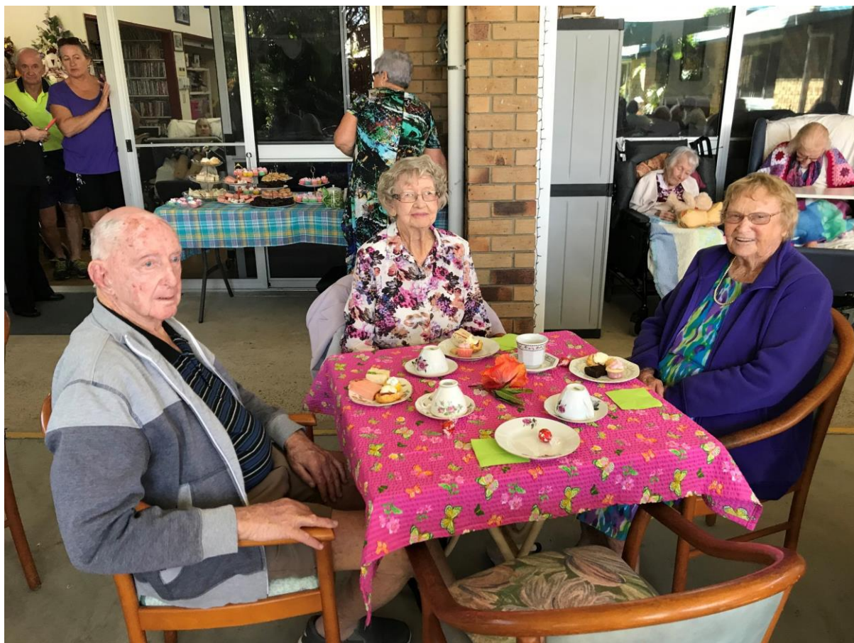
Sarina Aged Care Residential Home