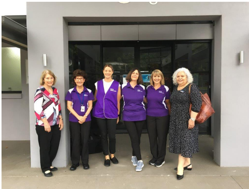
Regis Aged Care Whitfield, Cairns

To check your eligibility for a COVID-19 vaccine, visit the COVID-19 Vaccine Eligibility Checker: ( https://covid-vaccine.healthdirect.gov.au/eligibility ) or if you prefer not to use the online option, you can call the National Coronavirus and COVID-19 Vaccination Helpline on 1800 020 080.