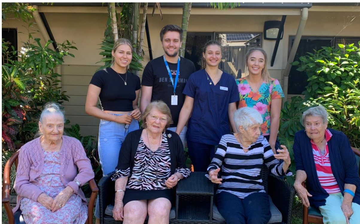
Loreto Home for the Aged, Townsville