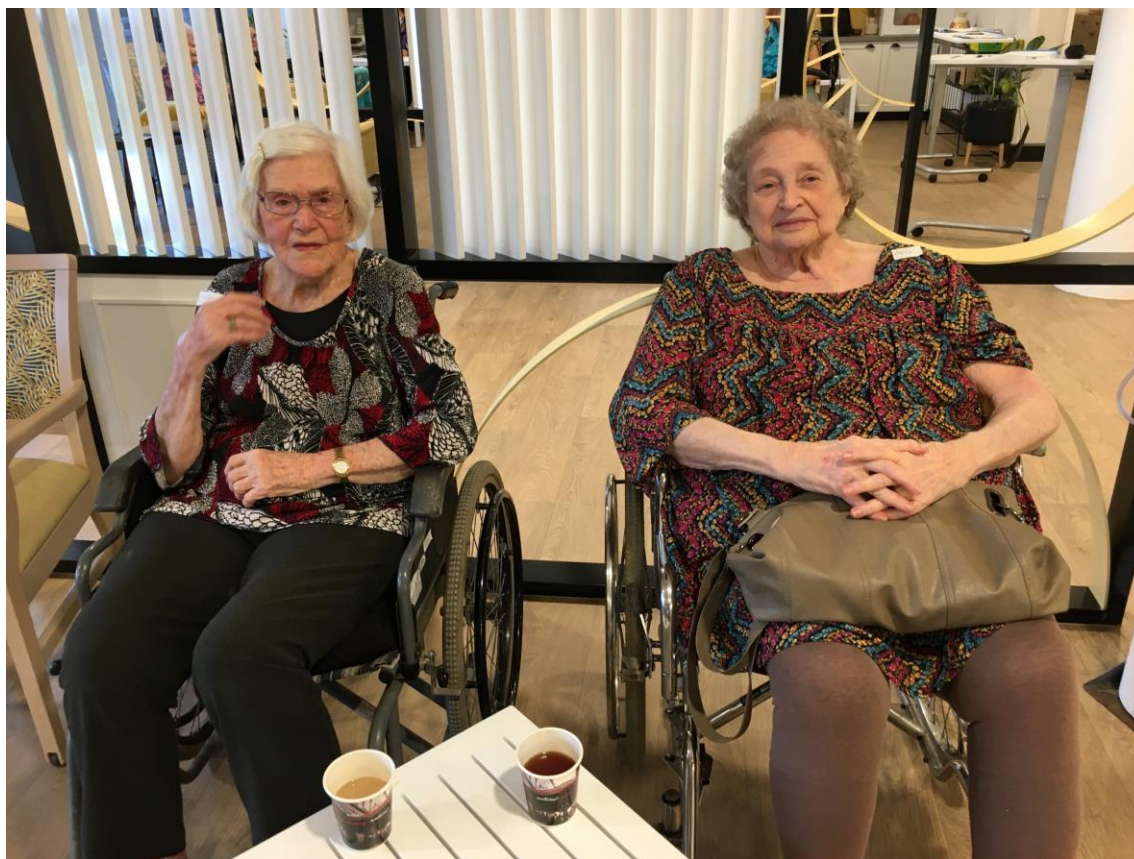
Warrina Innisfail Aged Care Facility