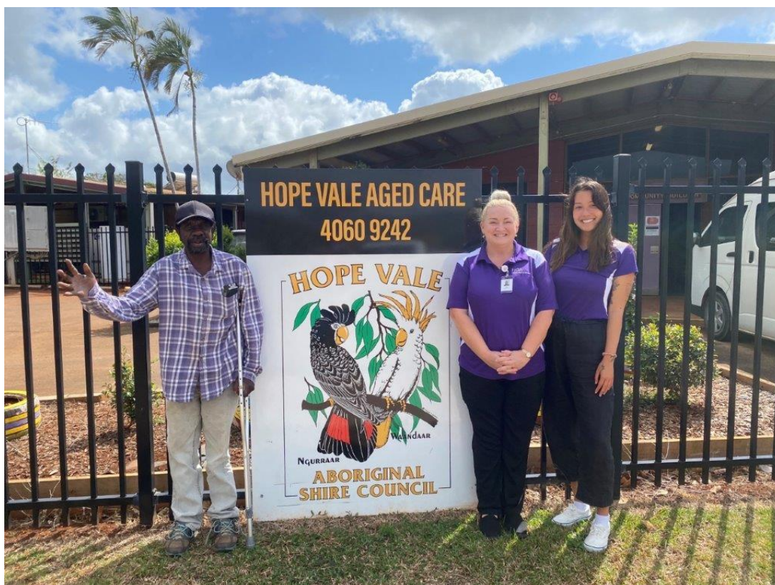
Hope Vale Aged Care, Cape York Peninsula