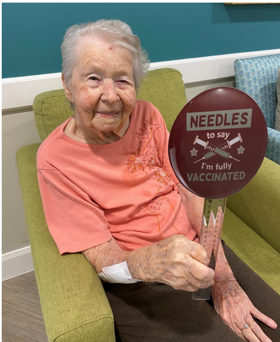
Photos: Murroona Gardens aged care facility, Bowen